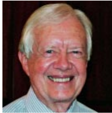
President Jimmy Carter