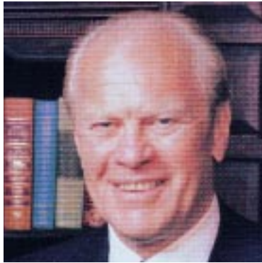
President Gerald R. Ford